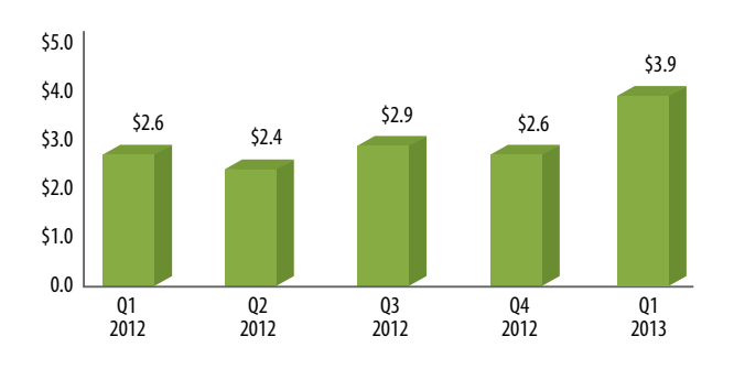
Total Investor Proceeds Raised Per Quarter (in $ Billions)